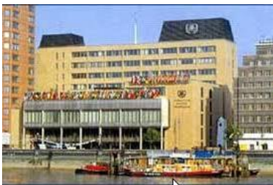
IMO Headquarters London