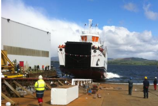
Launching of the MV Lochinvar Hybrid Ferry 23rd May 201