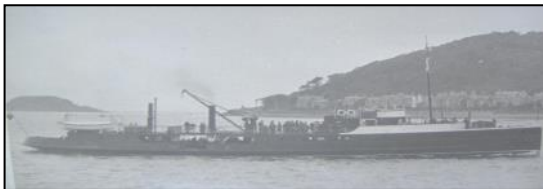
MV Lochinvar circa WWII