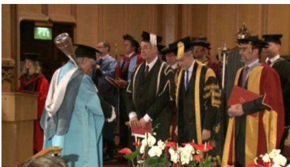
Graduation Ceremony from the video http://www.city.ac.uk/graduation/past-ceremonies

Find out more at : http://www.city.ac.uk/alumni