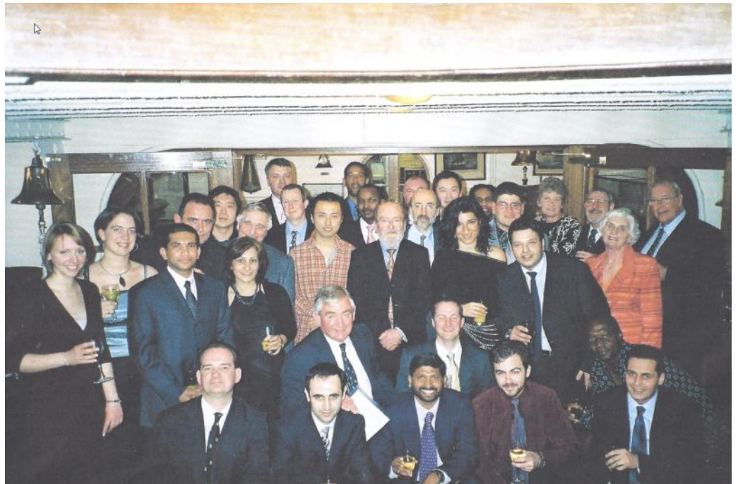
Scanned from hardcopy. Circa 2003-4. Annual course dinner on HQS Wellington.

When is the start date of a programme? Is it when the first cohort arrives. In that case MOaM 'started' in 2003. Or is it when the first group of full-timers graduate. For MOaM that would be 2004. From 2003-4 to 2013-14 much has changed in the Maritime Industry and the world.