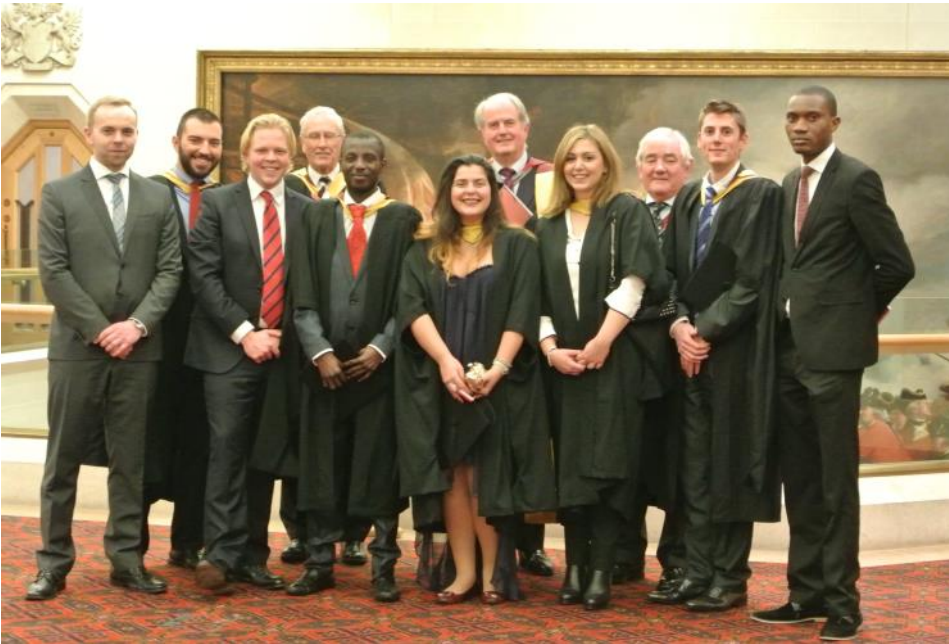
Graduation Ceremony Wednesday 29th January 2014. Portrait Gallery Guildhall London. Congratulations to the class of 2012-13.